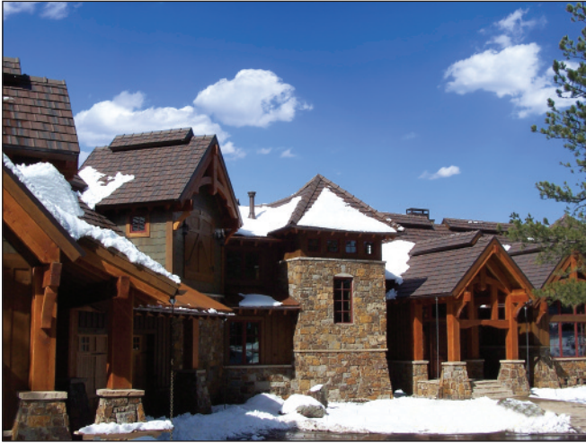
ProShake Plus® Madera Shake