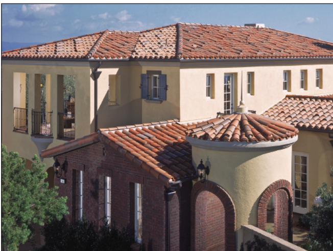
Faux Mission Installation with All-Weather Terracotta Flashed